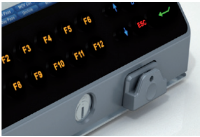
Optional integrated hole punch